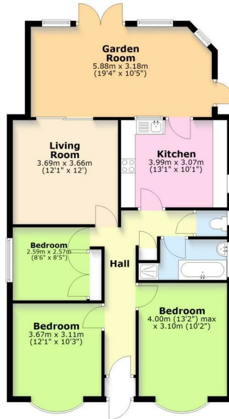
Total area: approx. 91.4 sq. metres (984.2 sq. feet) The Floorplan is intended as a guide only and all measurement are approximate and not to scale. Plan produced using PlanUp.